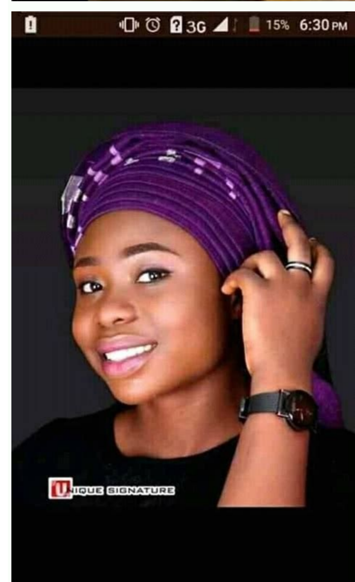
Evangelist bisi alawiye songs. Evangelist bisi alawiye song download.